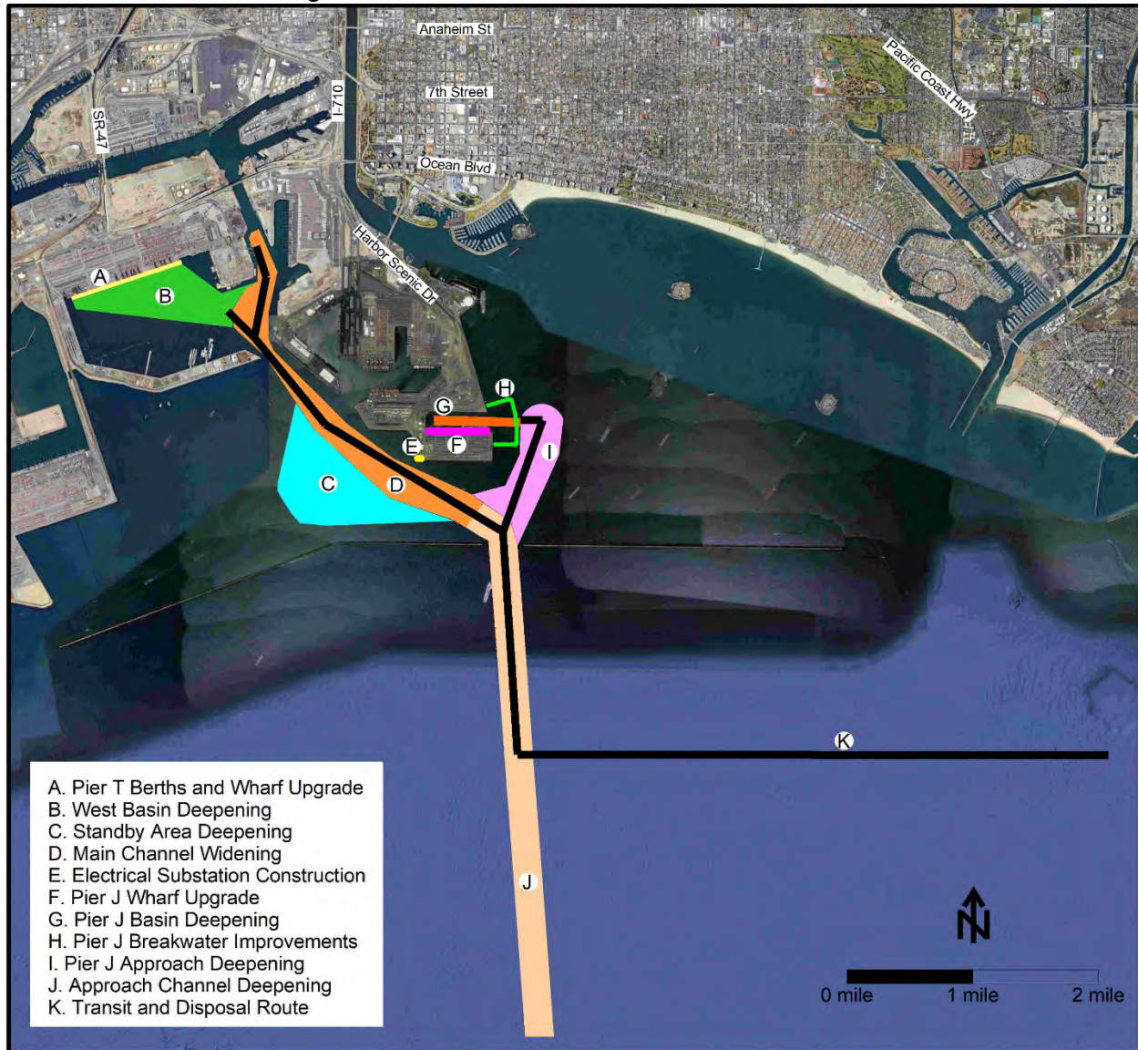
Figure H2.1. Construction Sources Modeled in AERMOD