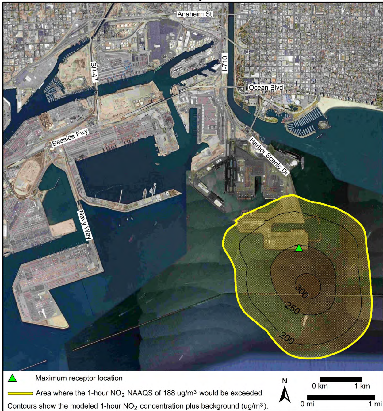
Figure H2.3. Location of Maximum Concentration and Area of Exceedance of the 1-Hour Federal NO 2 Threshold, With Mitigation

Figure H2.3 shows the area where the mitigated modeled 1-hour federal NO 2 concentration (presented in both Tables H2.6 and H2.7) would exceed the threshold, and the location of the maximum on-land receptor. The figure applies to all Action Alternatives because short-term activities (24-hour, 8-hour, and 1-hour) would be nearly identical and would therefore result in the same concentrations for all Action Alternatives. The exceedance area is over Port property and open water. There is no figure for the 1-hour state NO 2 concentration because the mitigation measures would reduce the modeled on-land concentrations to less than significant.