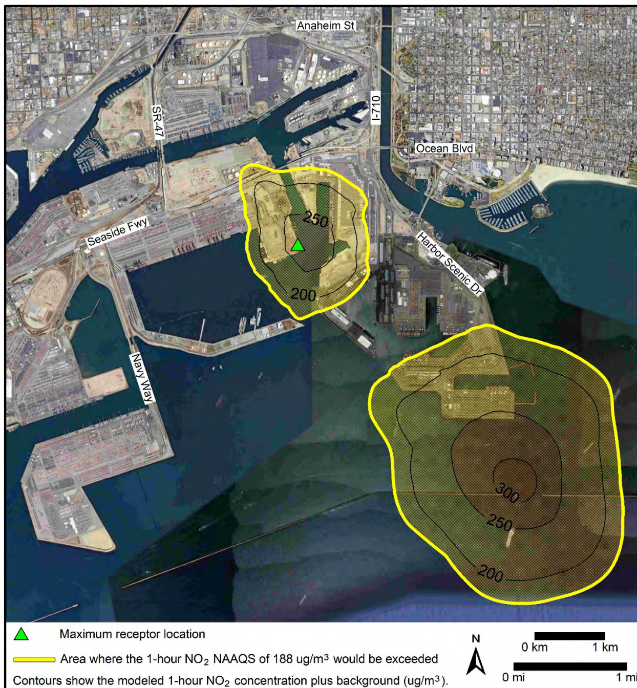
Figure H2.2. Location of Maximum Concentration and Area of Exceedance of the 1-Hour Federal NO 2 Threshold, Without Mitigation